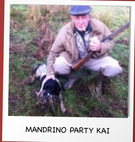
MANDRINO PARTY KAI