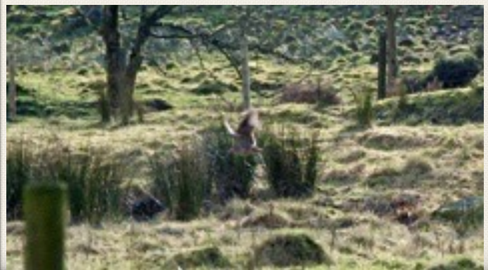
Top picture -walking to do the evening flight on the Isle-of-Bute, Bob Glynn and Dave Ferguson with the best bag to two guns in 2010 - 1 day!!! a woodcock makes a break for freedom