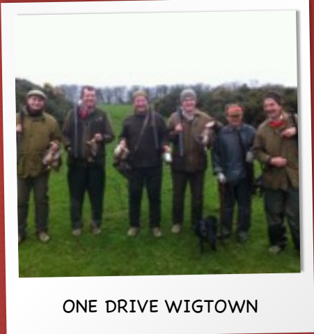
ONE DRIVE WIGTOWN

I have a new shoot for 2015 on Anglesey which is simply as good as it gets with daily 40-70 woodcock lifts, 100-200 snipe lifts add over a 100 duck ponds canals and water courses and we have duck to water your eyes, add resident Greylags and Canada geese and we have a rounded great wild bird shoot its over 3000 acres so we can get 3 days in GROUSE MOOR LOCALLY add a 4000 acre grouse moor and we can do 4 days hunting with pointers or springers.Telephone 07795-214934 for Anglesey brochure or email :- enquiries@woodcock-hunting.com